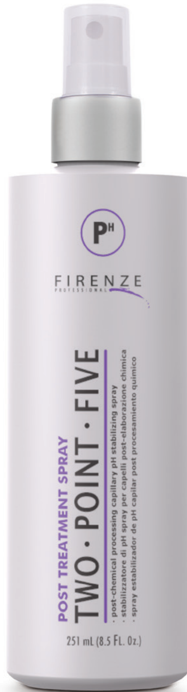
POST-CHEMICAL PROCESSING CAPILLARY pH STABILIZING SPRAY